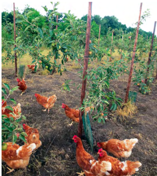
Two year old orchard in free range area Ref: Louis Bolk Institute

A free range area contributes to chicken welfare. However, chickens prefer range areas with shelter provided by trees, bushes or artificial structures. A farm with 10,000 chickens needs a range area of 4 hectares. Planting such a large area with trees is a big investment. Introducing commercial fruit trees is one way to add a valuable revenue stream. Every fruit species has particular needs and some will require additional investment. For example, cherry trees require netting for protection against birds. This leaflet explains the requirements of incorporating apple trees into a free range poultry system.