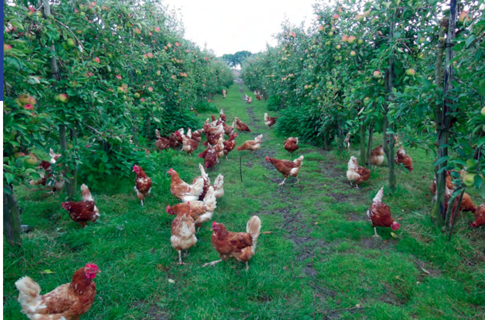
This 1.4 ha orchard in a 2.4 ha free range area provides enough shelter for chickens to travel up to 200m from their base (This picture was taken at 100m). Ref: Louis Bolk Institute