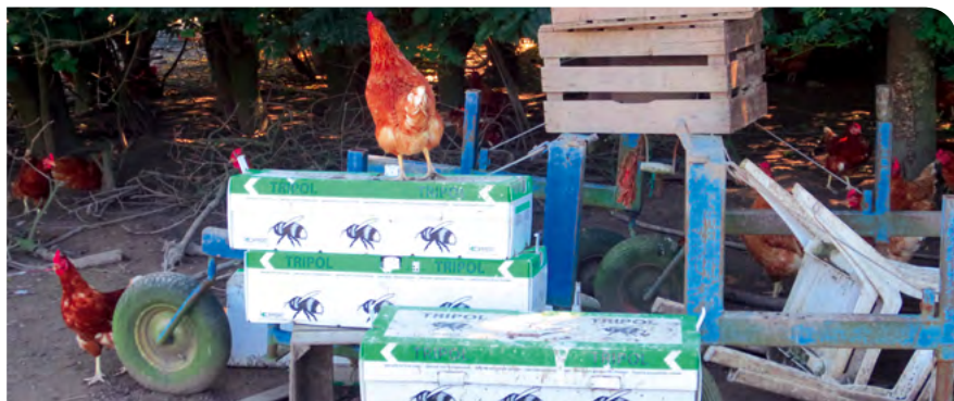
For food safety reasons neither the chickens nor their manure should have any contact with the fruit. Ref: Louis Bolk Institute