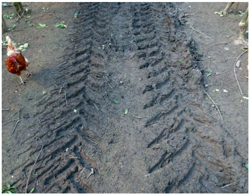
Close to the chicken house the soil condition is compacted and wet due to chickens. Compaction of the soil by machinery will also impair tree growth and apple production. Ref: Louis Bolk Institute

Apple trees need loose dry soil, therefore, conditions can be very challenging for apple trees growing near to the chicken house. In this area, it is more appropriate to plant cheaper and more robust species or rootstocks with more growth potential. In a range area, bigger and older trees, than those which would be suitable for an orchard without chickens, need to be planted. It is sensible to plant 2-3 apple varieties, since they may react differently to seasonal changes and the presence of the chickens.