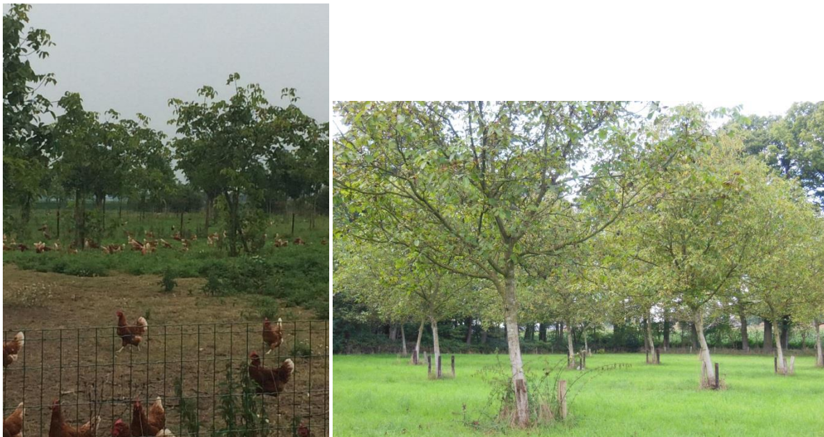
Figure 7. Walnut trees 8 years old (left) and 15 years old (right).

Two Dutch organic poultry farmers have walnut trees in their free range area (Figure 7). Farm 1 has 11,500 laying hens and 30 nearly 70 years old walnut trees. A variety of cultivars is planted in order to assure their pollination. They grow from 10 m from the hen house onwards, an area intensively used by the hens who keep the soil bare. This makes nut collection easier. The nuts are collected by the customers themselves; they pay less (advantage for them) and the farmer has less work and needs less space for drying and storing (advantage for him/her). Depending on the weather in spring, this farmer sells up to 1000 kg nuts in autumn. Farm 2 has 10,000 hens and 100 young (8 years) not yet productive walnut trees of one cultivar. They were planted on a distance of 10 m x 10 m, 90-100 m from the hen house. The only significant work is pruning the lower branches. The harvest until now was too small to collect. In September 2014 a visit for poultry farmers was organized within AGFORWARD to two locations with 15-year old walnut trees (Initial Stakeholder Meeting Report Poultry in the Netherlands).