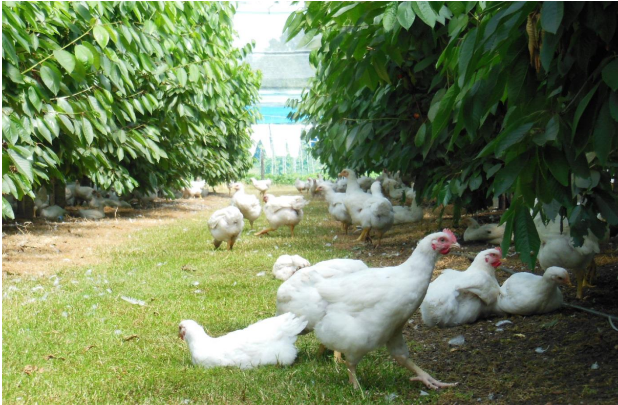
Figure 4. Cherry orchard in free-range area of a broiler farm

Experiences of the combination of cherries and broilers: