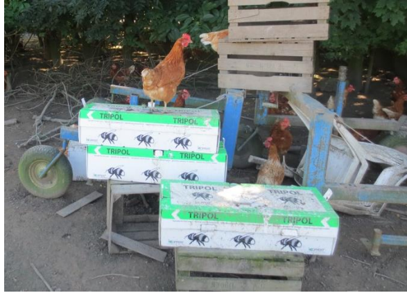
Figure 3. Contact between poultry manure and fruit for human consumption, such as can happen when fruit crates are left unattended, should be avoided.