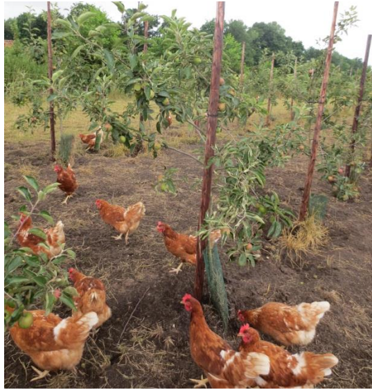
Figure 2. Apple orchard in free-range area, 2.5 years after planting

areas. More information on different aspects of the combination apples and egg production is published in Bestman (2015).