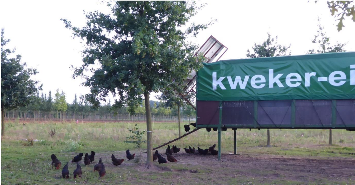
Figure 8. Young hens in partially harvested tree nursery parcel

Experiences with the combination of tree nursery and egg production: