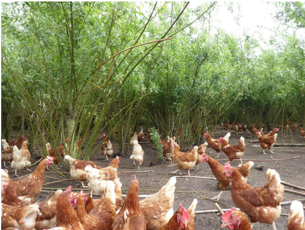
Figure 5. Free-range area with 2.5 years old biomass willows

to be controlled three times mechanically during the first half year, when the willows grow 1.5-2 m high. Moreover, during the first 2.5-3 months the willows need to be protected against leaf eating hens. Planting large parcels instead of strips reduces the damage by the hens. Further from the hen house less damage is seen as well. After the first season, cuttings of 1.0-1.5 m can be cut for filling up empty spaces caused by mortality. The original plan was for mechanical harvesting every 2-4 years in the period November to March. However, because the harvesting machines were too heavy for the soil, the farmer decided to let a gardener cut the branches and use them for constructing decorative garden fences. In case of harvest every four years, 80 tonnes of fresh biomass at a time is expected. The wood chips can be sold 'fresh' to tradesmen or 'dried' and after drying under a roof or special cloth (20-30 % water content) to owners of industrial woodstoves. See Boosten (2015) in Bestman (2015) for calculations of costs and benefits in Euros.