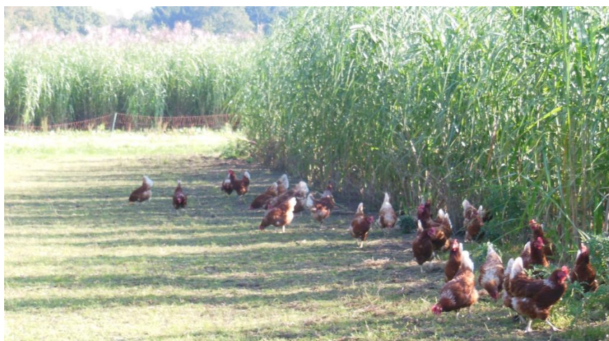
Figure 1. Free-range area planted with Miscanthus , 1.5 year after planting

In the Netherlands the mean size of an organic egg farm is 11,000 hens 1 with 4.4 ha free range area. A mean conventional free-range farm is 24,000 hens with 9.6 ha free range area (PPE 2013). Providing cover on such large surfaces is expensive. Therefore, within the Trees for Chickens project (2012-2015) 2 , farmers investigated means of establishing plantations where it is somehow possible to get revenues from the range plantation.