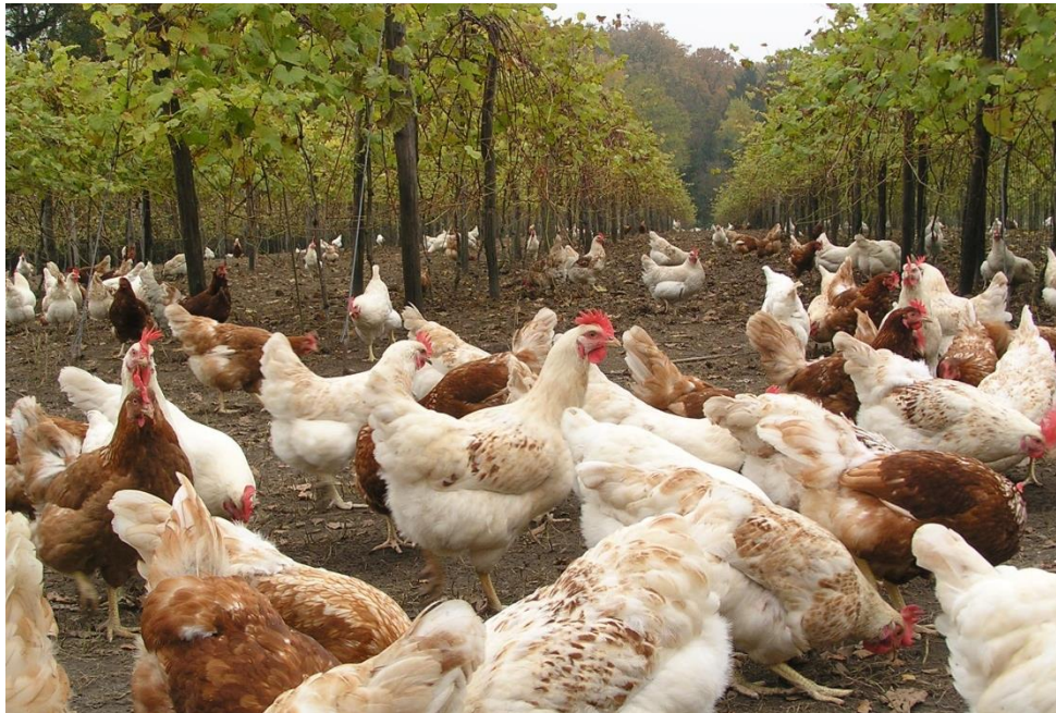
Figure 9. Vineyard in free-range area (farm not involved in AGFORWARD).

A variety of aspects related to the tree species mentioned in this report are summarized in Table 1.