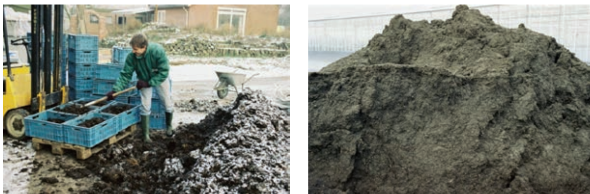
Figure 2.1 Manure (left) and compost (right) used for on-farm experiments on the effects of different organic amendments on soil structure and sealing.

The type of soil, the aim of the compost application and the availability of organic materials will influence the choices of a grower for the most suitable forms of organic amendments. There are limited possibilities for greenhouse growers to apply green manures or crop rotations with soil-nurturing and deep-rooting crops like grains, so the grower is dependent on the use of a variety of manure and compost types in order to sustain the organic matter content of the soil. The grower may need to make important choices between the use of fresh manure, compost and digestate. Compost is the result of an aerobic transformation process, while digestate is the result of an anaerobic process. The differences between compost and digestate are discussed in Chapter 7.