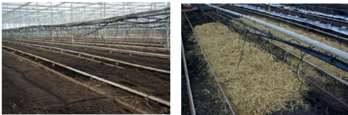
Figure 2.2 Application of compost in organic greenhouse (left) and application of wheat straw in experimental plots (right). Straw has been traditionally used in cucumber cultivation to enhance soil temperatures in planting beds. It is experimentally used to stimulate lignin-degrading organisms in soil, and improve disease suppressiveness. As the materials are used on a very rich soil, the risk of nitrogen immobilization is limited.

In addition the fresh organic matter of manure will stimulate soil life in a different way when compared to organic materials that have been composted. Sometimes uncomposted crop residues are used, as in the use of lignin-rich crop-residues like wheat straw (Figure 2.2) to improve disease suppressiveness against soil-borne diseases. The most important constraint to the use of fresh instead of composted crop residues is the possible contamination with plant pathogens. There are no general rules that determine which kind of organic amendment to use. The biological, chemical and physical characteristics of the soil and the grower's experience of the soil determine the most appropriate choice. The regional availability of compost or manure may also play an important role in the final decision.