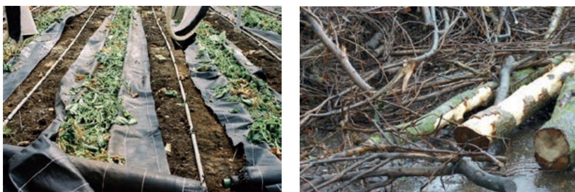
Figure 2.3 Bulking agents which can be used when composting manure are crop residues (left: cucumber) or wood (right). When crop residues are used, sufficiently high temperatures have to be reached during composting, for a long enough duration to avoid survival of plant pathogens.

Nutrient contents, DM (dry matter) and OM (organic matter) are given in % of fresh weight.