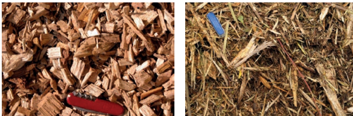
Figure 2.4 Wood chips (left) cannot be efficiently decomposed by compost microorganisms, whereas defibered wood (right) can. The use of defibered wood results in a better structure within the windrows and allows for a better aeration.

To improve the composting process, clays such as zeolites (5-10 kg/m 3 starting mixture) or clay-rich soil (3-5 % of the starting mixture) can be added. These materials buffer the composting process, diminish odor emissions and improve the formation of stable crumbs during the curing phase of the compost. The technical preparation of the input materials also plays an important role in the decomposition of the material. This is especially important for wood. If wood is chopped into chips, microbial colonisation is inefficient and the capacity of the wood as a structure-adding material to improve the aeration of the windrow is low. If the wood is correctly shredded and well de-fibered, microorganisms have good access to the material and the aeration of the windrow is highly improved (Figure 2.4). Finally, it is essential that the starting mixture contains sufficient moisture to allow the microorganisms to become active.