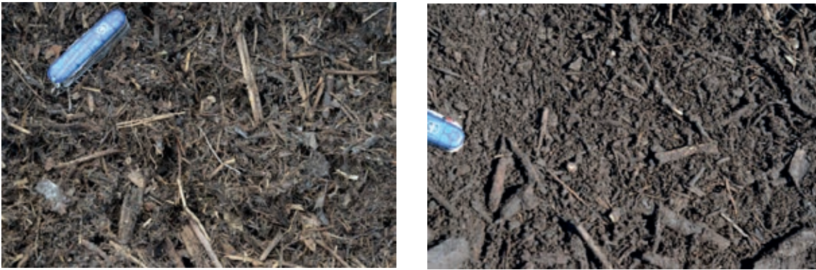
Figure 2.8 Structure of different types of compost. Left: young, carbon-rich compost, right: mature carbon-rich compost