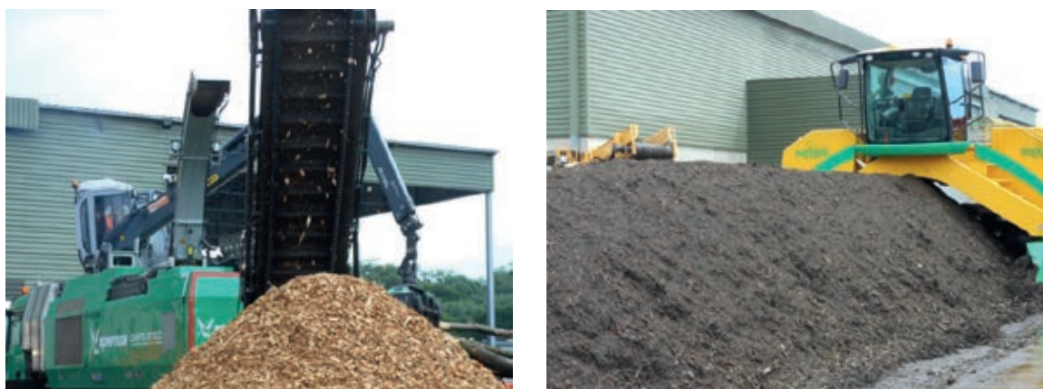
Figure 2.6 Mechanization has made large-scale composting possible: a drum chipper (left) and windrow turner (right).

In the 1930s and 1940s mechanical processes were further developed, mainly involving initial shredding and mixing of materials to facilitate composting. Giovanni Beccari developed and patented a new composting method in the 1920s in Florence, Italy. The Beccari method starts with anaerobic fermentation, and has a final stage in which decomposition takes place under partially aerobic conditions. Another system was developed in the early 1930s in Copenhagen. Partial decomposition of the feedstocks was obtained by pre-treatment of refuse in a rotating silo or drum. The materials were mixed and grounded before they were composted using the Indore method 7 . In the 1940s Eric Eweson developed a rotary drum composting system in the US. Influenced by Sir Albert Howard, he designed a system in which the compost material is anaerobically fermented in a large rotary drum, for 3-6 days, followed by windrow composting. This system has been very successful, and is still being applied 8 .