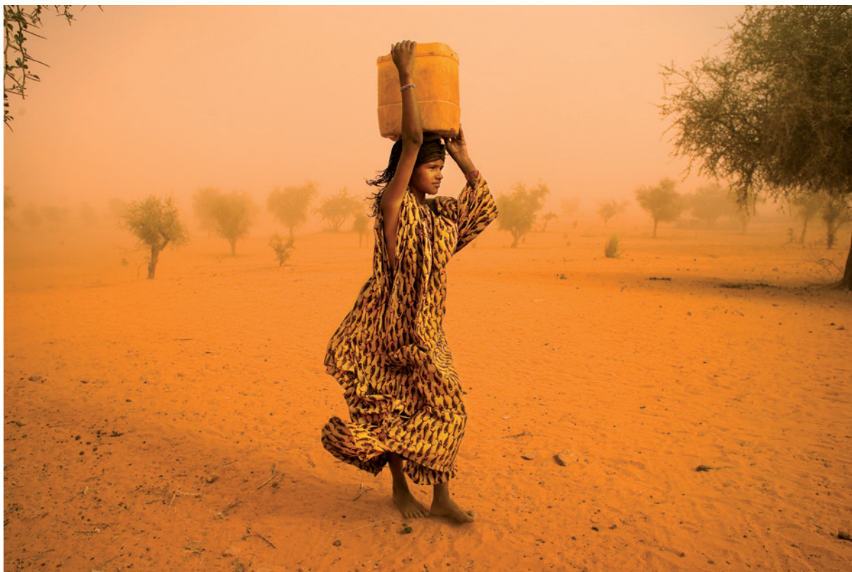
A Tuareg woman carries water through a sandstorm in drought-ridden Mali.