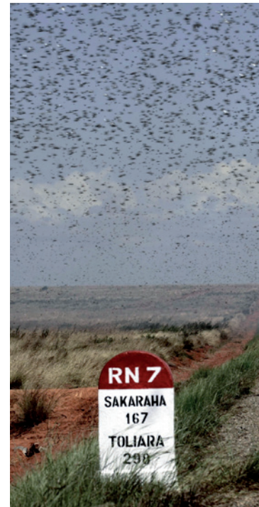
Global risks and losses from extreme weather, as in Thailand's 2010 floods, and agricultural failures, such as locusts destroying crops in Madagascar, are rising.

► countryside to cities affects water, food, climatic and energy systems planet-wide.